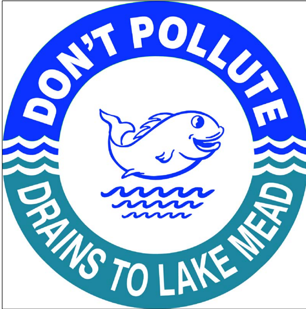
4" PLACARD - COLORS = BLUE AND GREEN

THIS EPOXY PLACARD MESSAGE AND SYMBOL HAS BEEN APPROVED BY THE APPROPRIATE CITY OR COUNTY ENGINEER. ANY OTHER EQUIVALENT MESSAGE AND SYMBOL DESIGNS WILL REQUIRE PRIOR APPROVAL OF THE APPROPRIATE CITY OR COUNTY BEFORE INSTALLATION. THE PLACARD MATERIAL SHALL BE EITHER POLYCARBONATE OR METAL AND THE FINISH SHALL BE UV AND ABRASION RESISTANT.