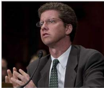
HUD Secretary Shawn Donovan

The Department of Housing and Urban Development’s mission is to increase homeownership, support community development, and increase access to affordable housing free from discrimination.