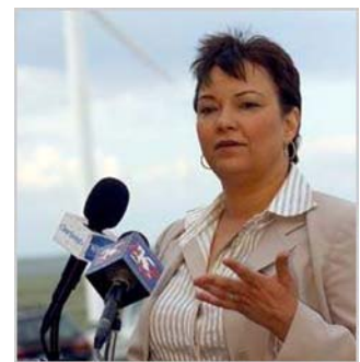
EPA Administrator Lisa Jackson

Where and how you build communities has an impact on the environment. EPA has numerous grant and other assistance programs to help Tribal, state, and local government support activities that protect human health and the environment and build more sustainable communities. These range from very large revolving loan fund grant programs such as the Clean Water State Revolving Fund and Drinking Water State Revolving Loan programs, which allow a state to offer low- or no-interest funds to utilities and others to make much-needed improvements to water infrastructure, to the broad Community Action for a Renewed Environment (CARE) grant program, which provides both financial and technical assistance to a community-based partnership that implements a solution to reduce releases of toxic pollutants and minimize people's exposure to them; to a Brownfields Cleanup Grant that provides funding for cleanup of a brownfields site.